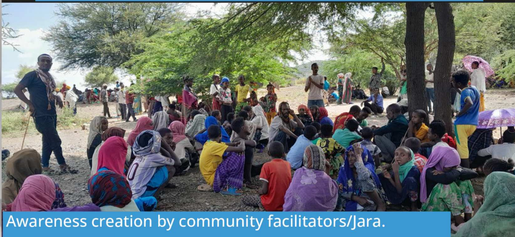
Awareness creation by community facilitators/Jara.