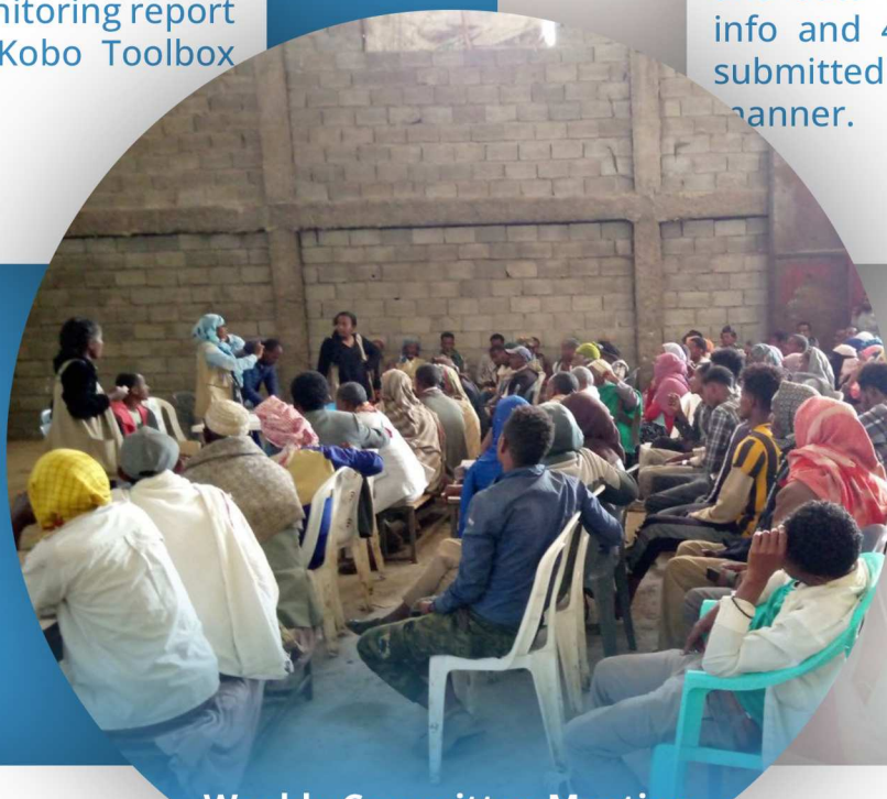
Weekly Committee Meeting

Monthly Service Monitoring and data collection, activity info and 4W matrix report submitted on timely manner.