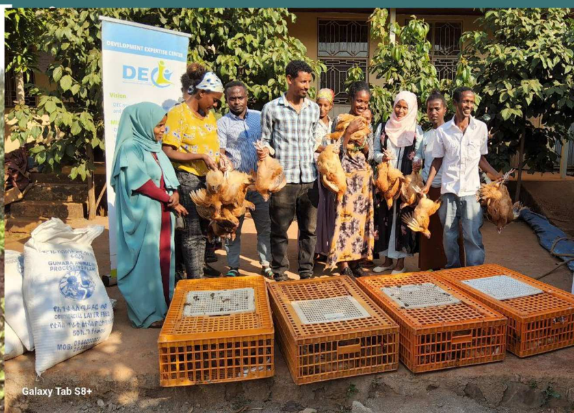
Galaxy Tab S8+