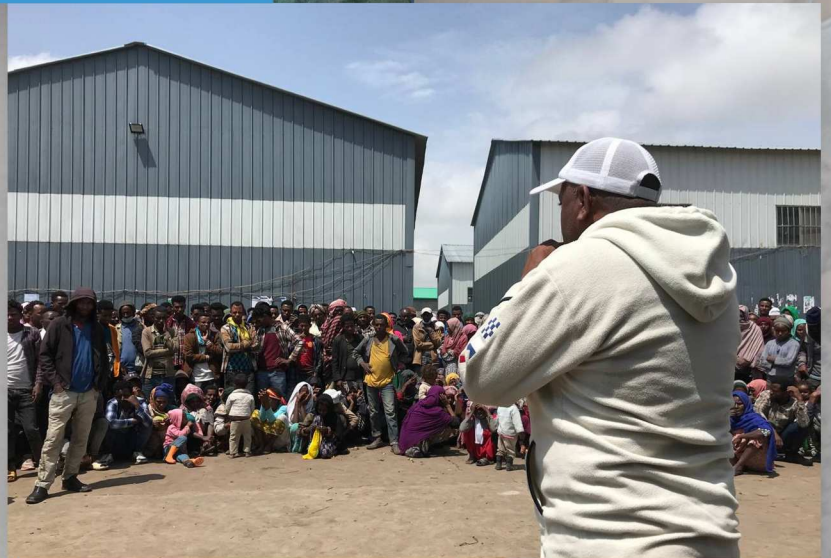
B. Awareness Creation at Debrebrihan.