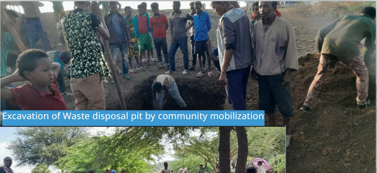
Excavation of Waste disposal pit by community mobilization

22 Awareness raising sessions were conducted in 20 IDP site regarding the hygiene and sanitation and how to use latrines and communal facilities in proper manner. A total of 11,788 individuals reached.