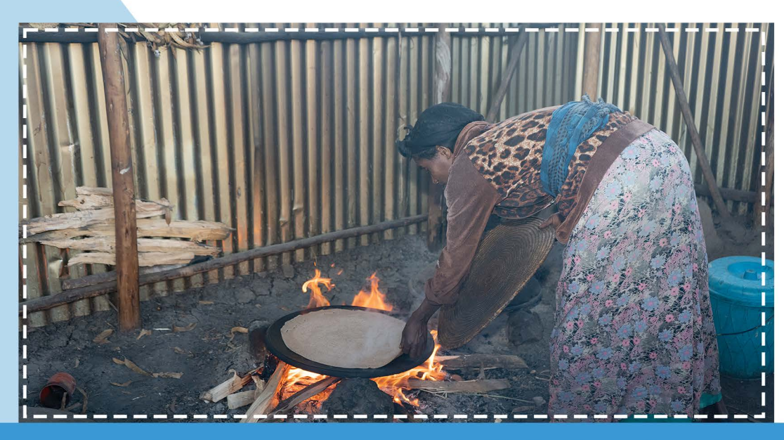
- Six communal kitchens were constructed in both south and North Wollo at different sites