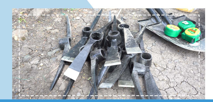
Small scale site Materials distributed in 7 IDP sites in North wollo and south wollo

10 street solar lights were installed at Jara IDP camp and Jari 1 and Jari 2 IDP sites in North wollo and south wollo respectively